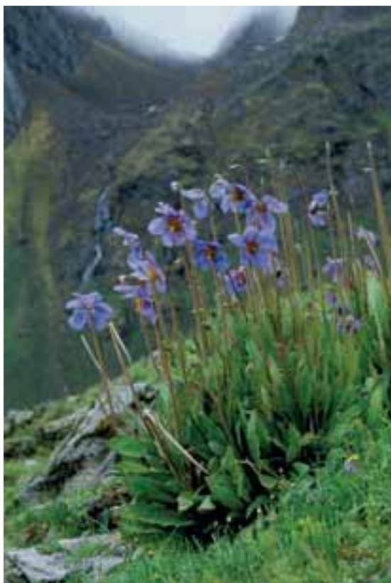
Fig. 4 Meconopsis grandis subsp. grandis in northern Jaljale Himal, east Nepal, alt. 4,450m. Photo: T. Yoshida (1990), 11, vii.

tolerate cattle trampling by forming substantial clumps with compact bases along with their hard and short rootstock. The sight of many plants with showy flowers scattered around the temporary houses could easily appear to foreigners as though the plants were cultivated.