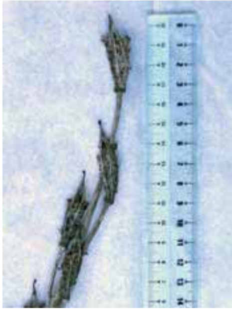
Fig. 10 Previous year's withered fruits of Meconopsis merakensis var. merakensis from north-east of Tsejong, Merak, east Bhutan, alt. 4,350m. Photo: T. Yoshida.