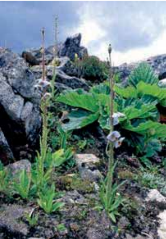
Fig. 6 Meconopsis prainiana var. prainiana at Serkyim La, Linzhi county, south-east Tibet, alt. 4,500m.