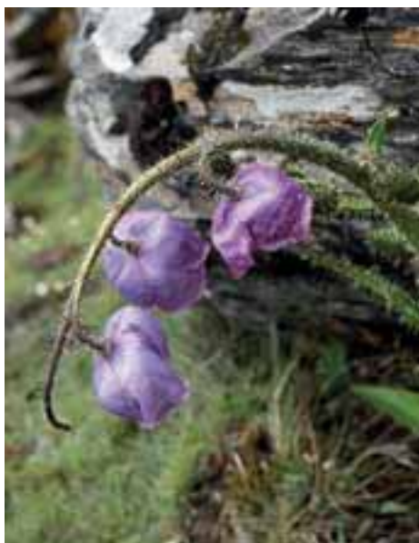
Fig. 8 Meconopsis merakensis var. merakensis with pale reddish-purple flowers born on curved rachis, north-east of Tsejong, Merak, east Bhutan, alt. 4,350m.