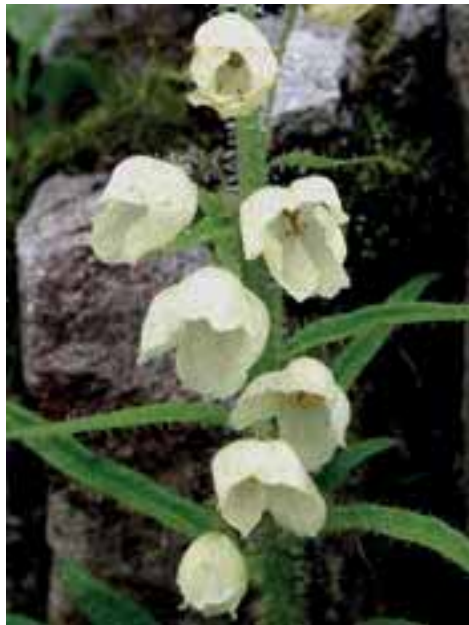
Fig. 12 Palest yellow flowers of Meconopsis merakensis var. albolutea at Bhangajang near Orka La, west Arunachal Pradesh, east India, alt. 4,100m. Photo: Takeo Morita (2014), 7, vii.