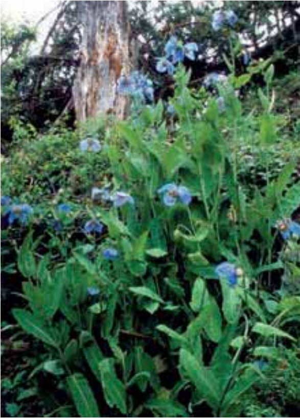
Fig. 5 Meconopsis baileyi , east of Tong La, Milin county, south-east Tibet, alt. 3,650m. Photo: T. Yoshida (1997), 26, vi.

pseudo-whorled bracts lower than the middle of the plant and often becomes completely scapose. The scapose-looking plants of M. grandis have sometimes been misidentified as a polycarpic form of M. simplicifolia with purple or deep-blue lateral-facing large flowers, or, as M. simplicifolia subsp. grandiflora Grey-Wilson, and vice versa; the last plant, growing in northern Bhutan and other regions, has been misidentified as M. grandis by some botanists.