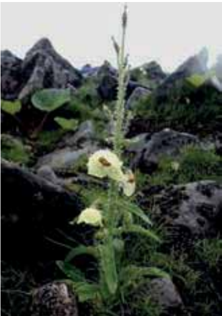
Fig. 11 Meconopsis merakensis var. albolutea at Orka La, Saktien, east Bhutan, alt. 4,200m. Photo: Shun Umezawa (2015), 10, vii.