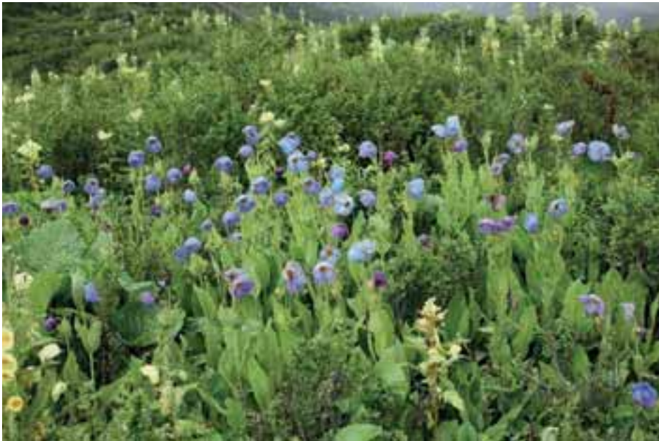
Fig. 2 Colony of Meconopsis gakyidiana , surrounded by yellow-flowered M. paniculata , at Tsejong, Merak, east Bhutan, alt. 4,000m. Photo: T. Yoshida (2014), 1, vii.