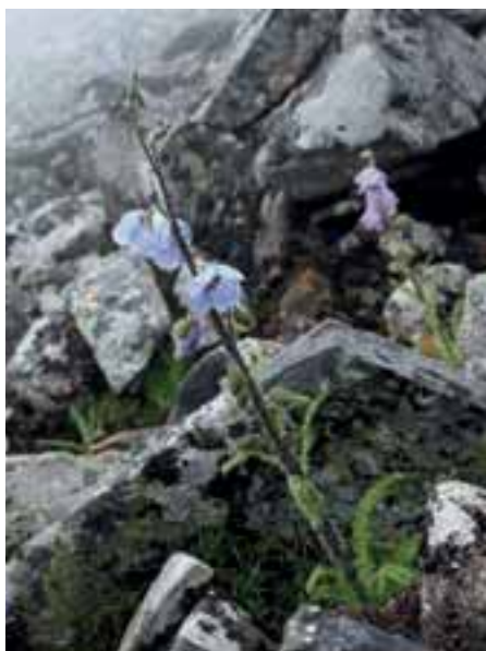
Fig. 7 Meconopsis merakensis var. merakensis , north-east of Tsejong, Merak, east Bhutan, alt. 4,350m.

We have selected Ludlow & Sherriff 659 as the type specimen of var. albolutea , because it is oldest of the available collections of this variety and shows the characters very well. This specimen was collected at Milakatong La located in the northern Tawang district, western Arunachal Pradesh of India, at 14,500ft (4,420m) elevation, and the flower colour is white according to the note on the specimen label. The living state of specimens with white flowers and sub-cylindrical fruit capsules can be visualised with the photos taken by Tim Lever at Pange La (south of Tse La) and Tse La in Mago district, which appeared in the Grey-Wilson monograph of the genus, pp. 263–264. The white-