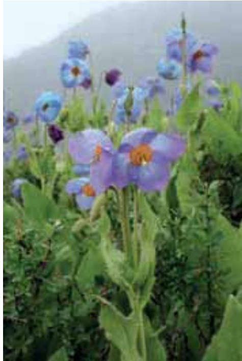
Fig. 1 Meconopsis gakyidiana at Tsejong, Merak, east Bhutan, alt. 4,000m. Photo: T. Yoshida (2014), 4, vii.