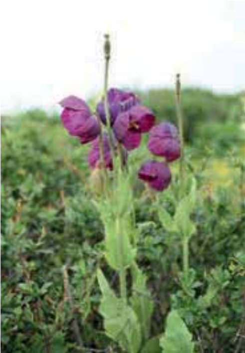
Fig. 3 Meconopsis gakyidiana with dark red flowers at Tsejong, Merak, east Bhutan, alt. 4,000m. Photo: T. Yoshida (2014), 2, vii.

we have chosen an epithet based on the Dzongkha word for happiness, gakyid , to reflect Bhutan's important cultural aspiration of 'gross national happiness'.