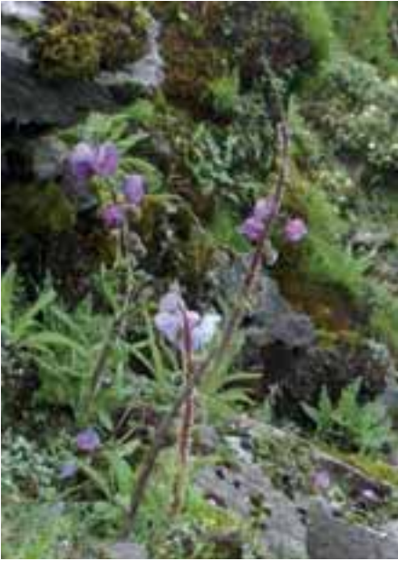
Fig. 9 Meconopsis merakensis var. merakensis , west of Orka La, Saktien, east Bhutan, alt. 3,950m. Photo: Setsuko Umezawa (2015), 12, vii.