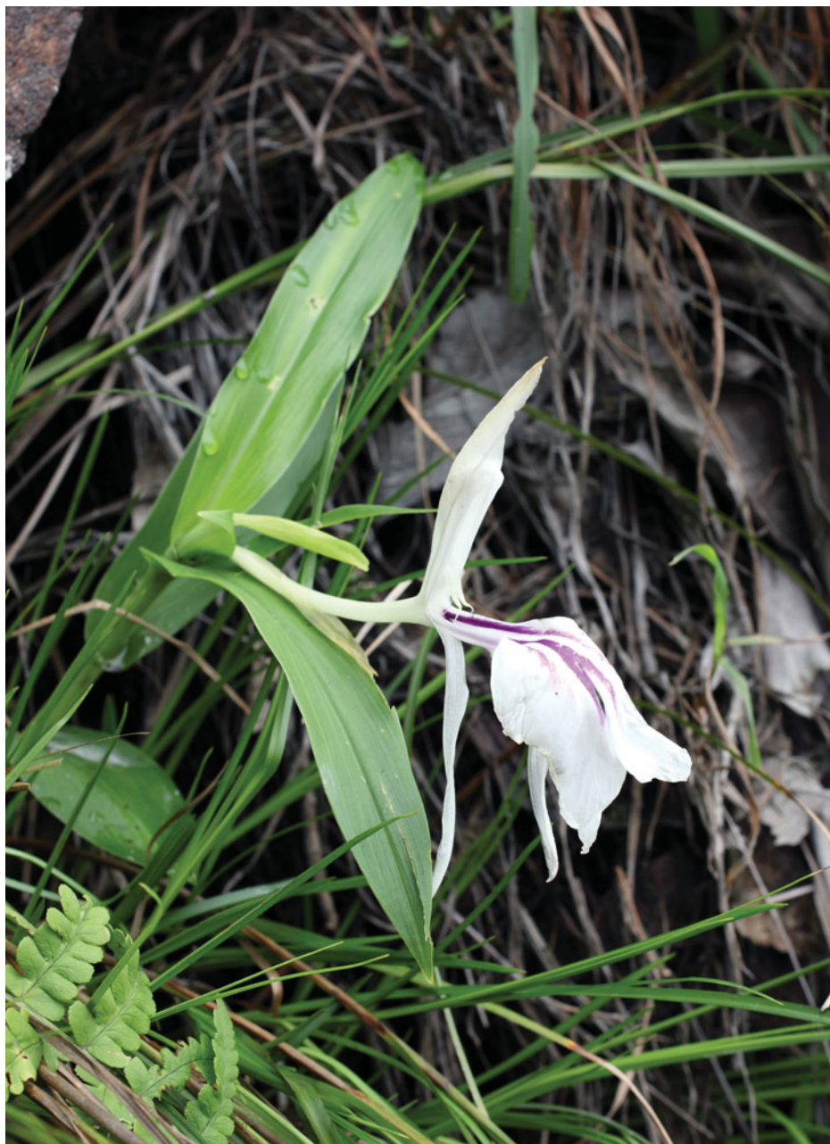
FIG. 1. Roscoeia megalantha at the type locality, whole plant. (Photograph by T. Yoshida, 27 June 2014.)