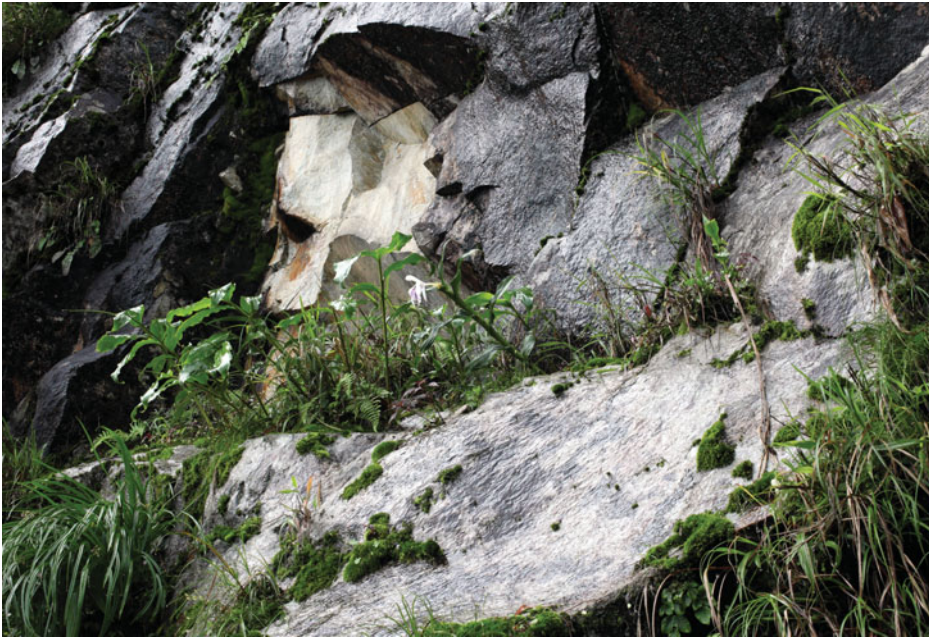
FIG. 2. Roscoeia megalantha at the type locality, habitat. (Photograph by T. Yoshida, 8 July 2014.)

somewhat shaded by adjacent rocky cliffs or trees; rooting into humid blackish soil among rocks with other herbs, mosses and ferns, below 3500 m altitude.